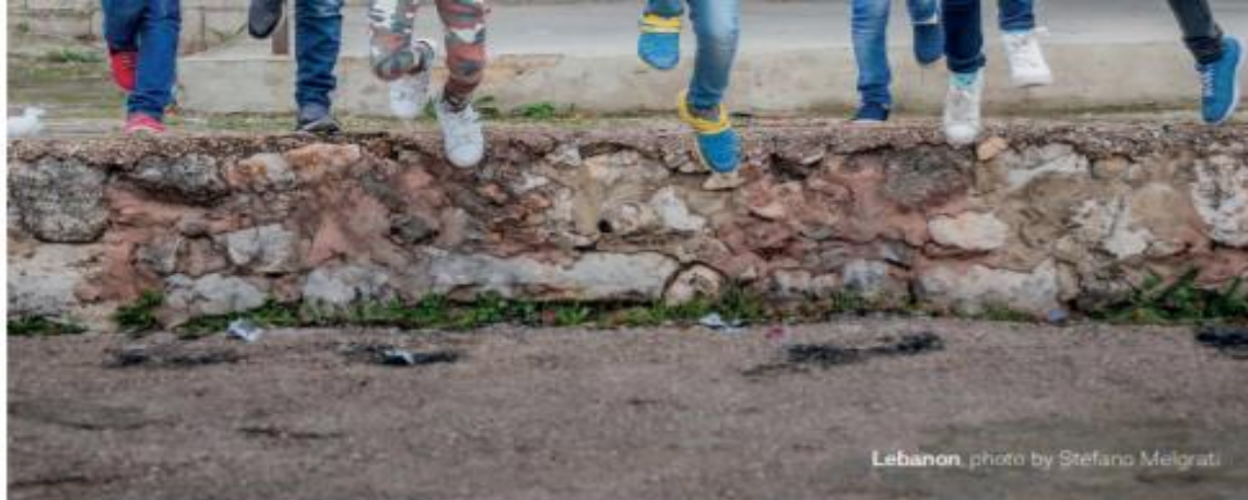
Lebanon, photo by Stefano Melgrati