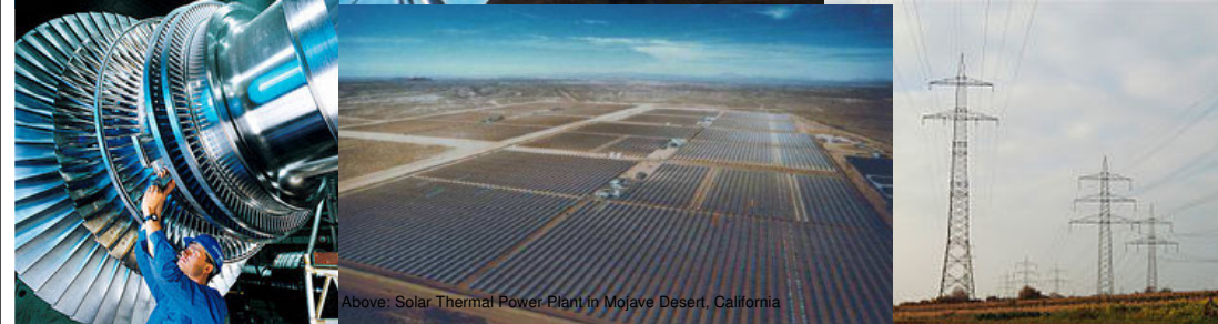
Above: Solar Thermal Power Plant in Mojave Desert, California

مشروع محطة طاقة عن طريق الطاقة الشمسية الحرارية