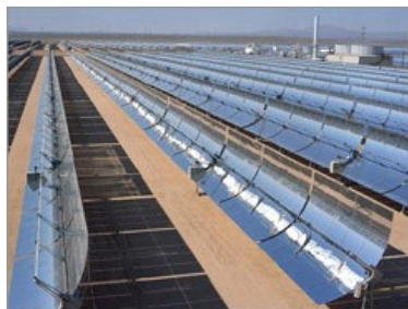
Solar collector array

So it is very important to implement one of the key technologies – energy producing technology – in this region on the one side and on the other side implementing a future energy resource for Europe when the conventional resources will be over and especially nuclear energy is not any more a desirable choice for European people after Fukushima accident.