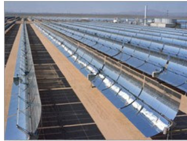
Solar collector array

So it is very important to implement one of the key technologies – energy producing technology – in this region on the one side and on the other side implementing a future energy resource for Europe when the conventional resources will be over and especially nuclear energy is not any more a desirable choice for European people after Fukushima accident.