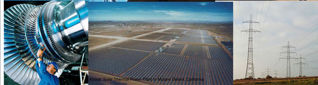
Above: Solar Thermal Power Plant in Mojave Desert, California

مشروع محطة طاقة عن طريق الطاقة الشمسية الحرارية