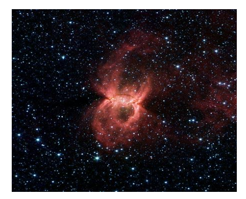
Illustration 1 : Caption: Black Widow nebula captured by Spitzer's IRAC.